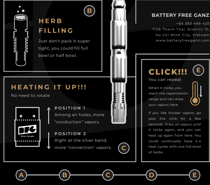
Fill D'chamber with herb

If you leave that tight, 1) you will not be able to draw because you're closing airflow completely 2) when you heat that, the cap will expand a little bit, and you're not going to be able to unscrew it until it's cool down. So this action means adjusting the airflow; you could try to draw the vape to feel the airflow change.